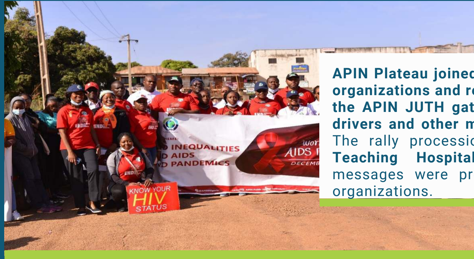
APIN Plateau joined government stakeholders, civil society organizations and relevant interest groups in a rally around the APIN JUTH gate and its environs to sensitize tricycle drivers and other market men and women in the environs. The rally procession ended at the Old Jos University Teaching Hospital (JUTH) Complex where goodwill messages were presented by representatives of various organizations.