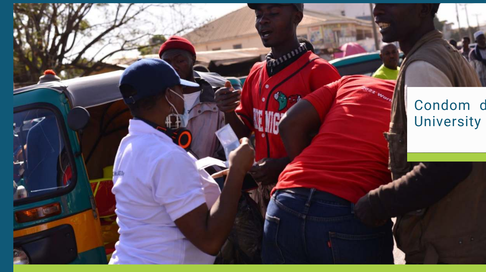
Condom distribution at the market during the rally around Jos University Teaching Hospital and its environs,