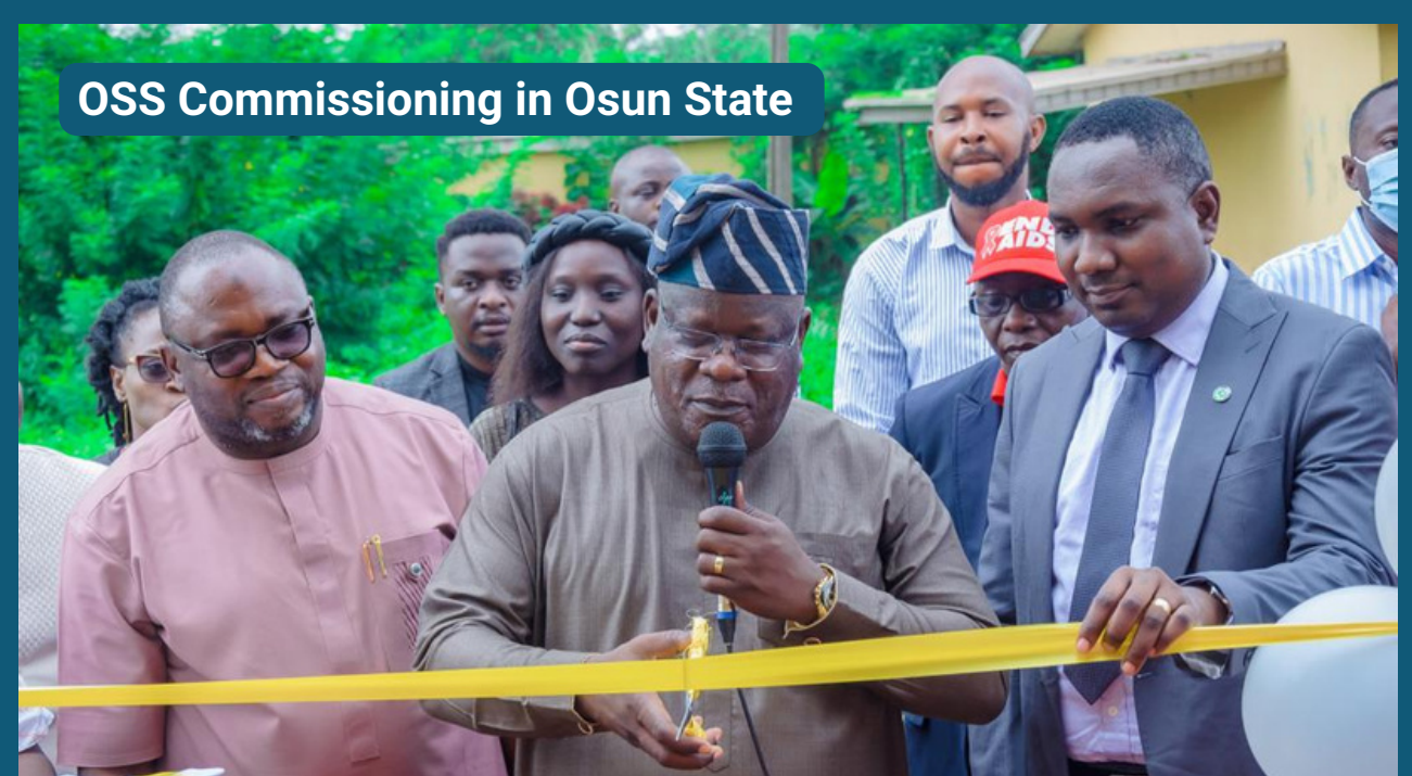
OSS Commissioning in Osun State

This quarter, we officially opened the doors of our Key Populations (KP) One-Stop Shops in Osun and Ogun States! The OSS is a specialized health facility where key populations who are most at risk of getting infected with HIV can access comprehensive, specialised treatment for HIV and other related health conditions in a safe, friendly and conducive environment and manner that is tailored to their specific needs.