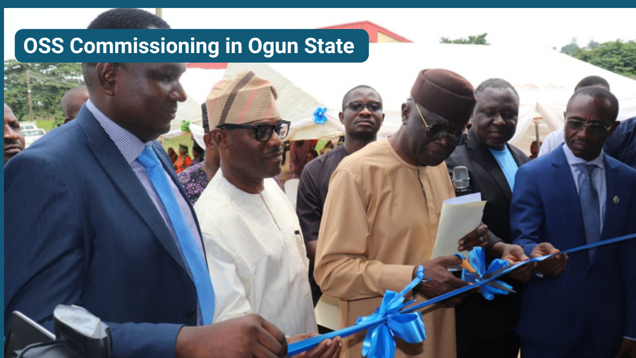
OSS Commissioning in Ogun State